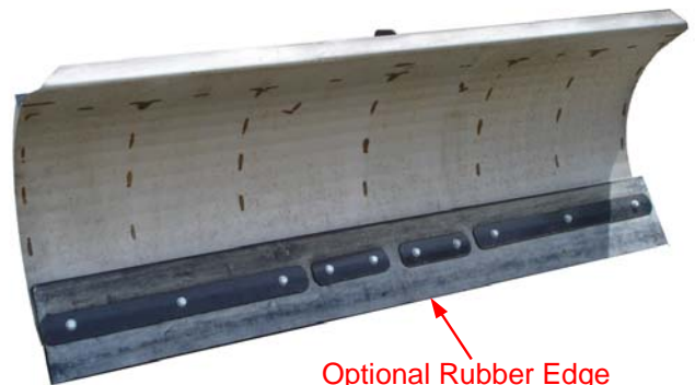
Optional Rubber Edge

Berlon's Snowblade is ideal for anyone's snowplowing needs. The blade is made out of stainless steel which prevents rusting due to scratch and wear. The Snowblade has a "trip" feature which, in the case of an operator accidentally hitting large objects such as rocks, the blade will tip and go over the object. The shock absorbers eliminate the blade from snapping back when it trips. The Snowblade has a side to side tip/oscillation for plowing on uneven surfaces. Besides being able to tip side to side, the Snowblade has a hydraulic angle allowing the operator to push snow to either side of the skidloader. The reversible bolt on cutting edge found on the Snowblade is made out of 3/4" x 8" steel. A rubber edge is also available. The optional snow plow shoes reduce wear on the cutting edge and minimize gravel removal while plowing. With all these features it is easy to see that the Berlon Snowblade is ideal for anyone on the, farm, jobsite or even at home!